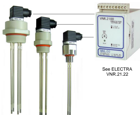
See ELECTRA VNR.21.22